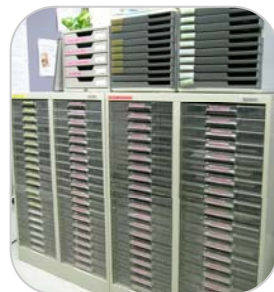
Mail Box for each International Students of Engineering.