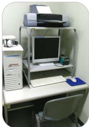
5 Computers, 2 Printers, 1 Scanner