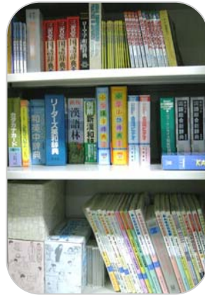
Free use, Japanese Materials