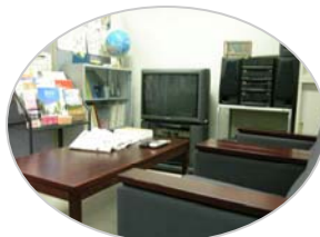
Information and Relaxation